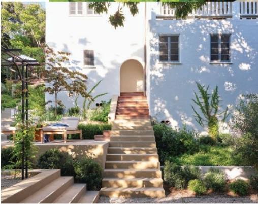
From left: Patricia Benner transformed a Santa Monica home's steep outdoor space into a lush, multilevel garden; among the different areas is an outdoor dining room, a cozy living room, a meditative garden, an outdoor shower and more.