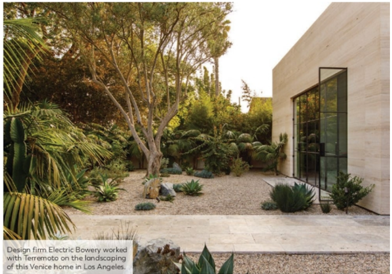
Design firm Electric Bowers worked with Terremoto on the landscaping of this Venice home in Los Angeles.